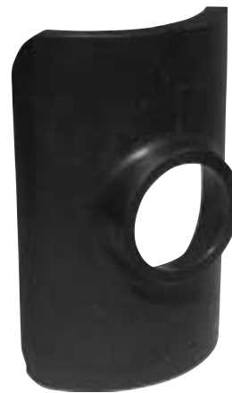
Reinforced reducing tee

AUSTRALIAN DESIGN REGISTRATION NUMBER 139414